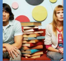
Now what do we do?