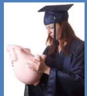
Can I really afford college or training?