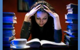
It is all so confusing!