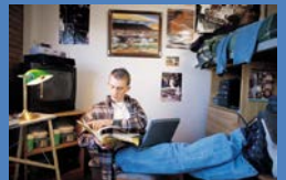
What should I study?